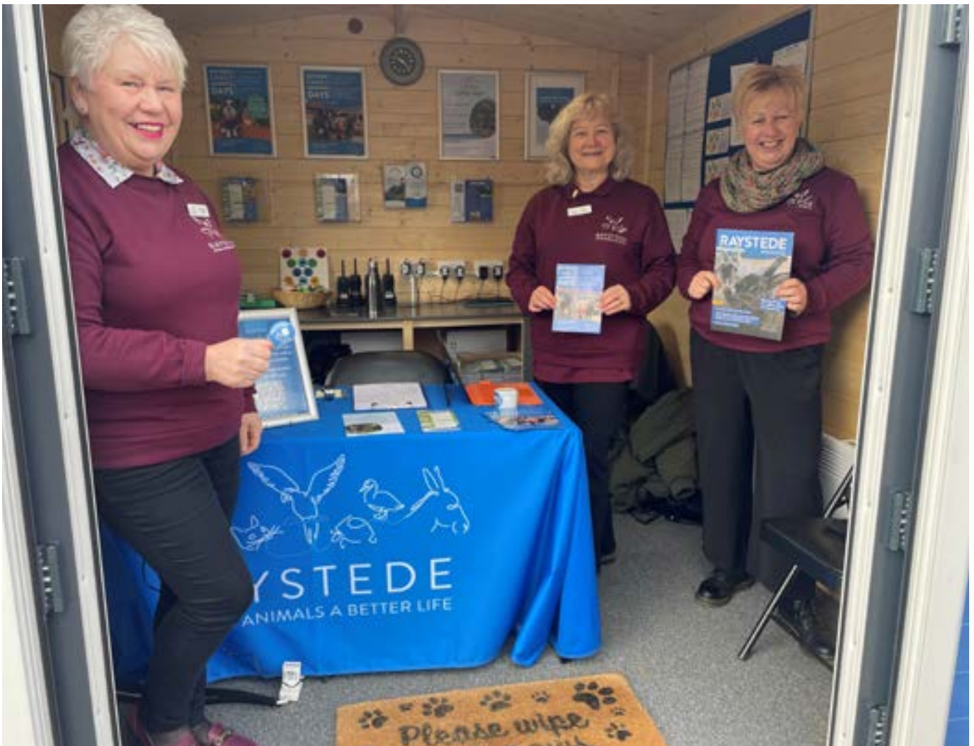
Happy volunteers in their new cabin

We have had several new recruits join the Welcome and Engagement Team, please do stop to say hi as you pass them. To help them all manage the visitor check-in process, can you please briefly tell them you are staff, or flash your badge as you go by, especially if you are not in uniform. We task them with checking in all visitors and so they need to know they can simply let you pass, and not stop you to ask for a ticket!