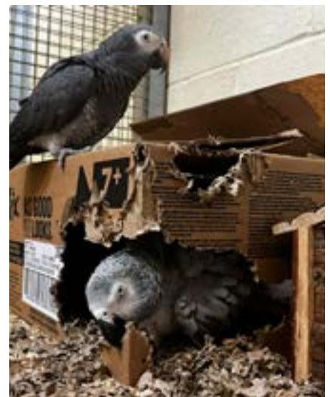
Dillon & Rosie

We placed Dillon, a Timneh Grey, who had sustained lower beak damage, with Rosie, an African Grey, who was on her own and in need of companionship. Dillon could not be placed back in her group of Greys as it was possible the beak damage was through an altercation with one of them. Both being hens, we were not sure if it would be a good mix but over time, they have become friends, being similar characters. Out of curiosity, Rosie will follow Dillon outside which is good as she gets fresh air and stimulation, they also chew boxes together, which is great fun.