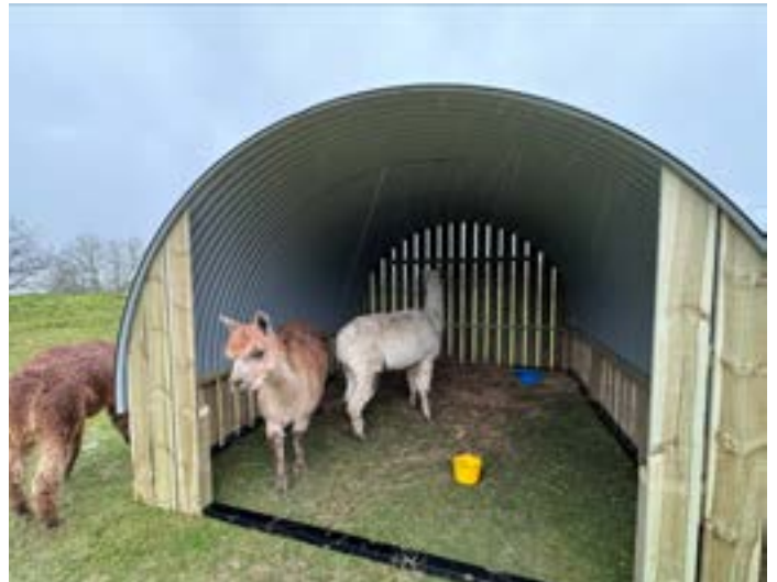
Alpacas in their new pod

A big thank you to the Fundraising Team for our new alpaca Pod, the alpacas have been enjoying having a shelter of their own where they can eat out of the rain and it will provide them with shade in the summer too!