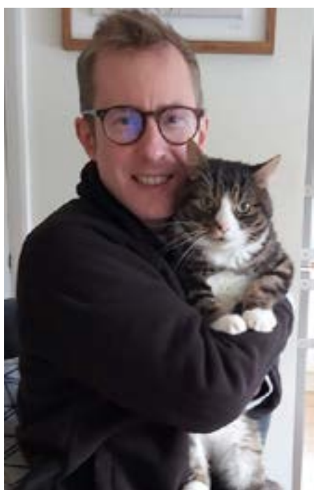
Simon & Buster