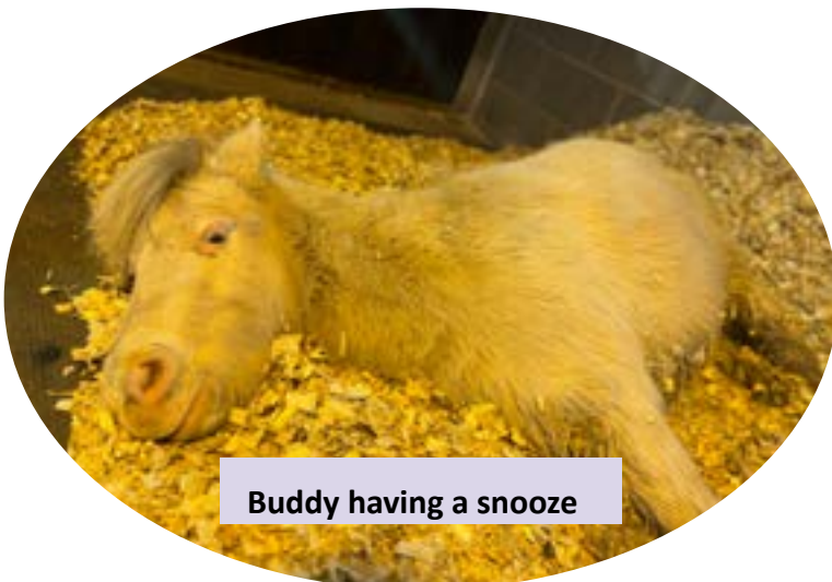
Buddy having a snooze

Our cheeky Buddy is officially reserved and will be off to his new home in the spring.