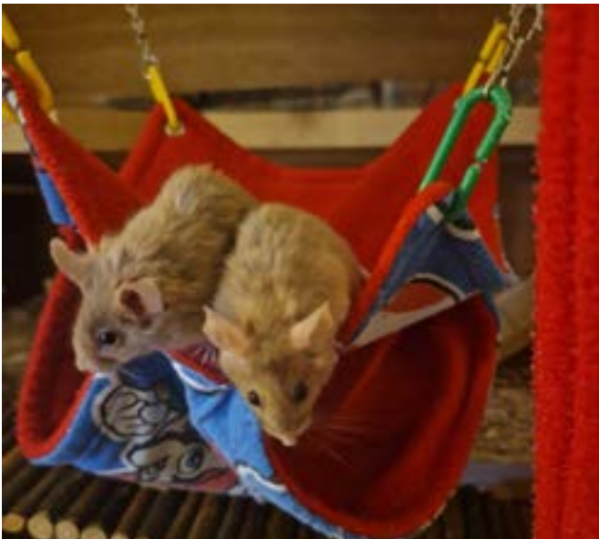
Happy & Sleepy

We've been busy playing musical chairs with our six cockerels (yes, six!!) to find where they fit best in the various flocks and areas in the Sanctuary after a series of fall outs and gender changing hens. All is now peaceful in the Sanctuary, except for the daily crowing matches. As I type, our handsome Frankie is due to go to his new home shortly.