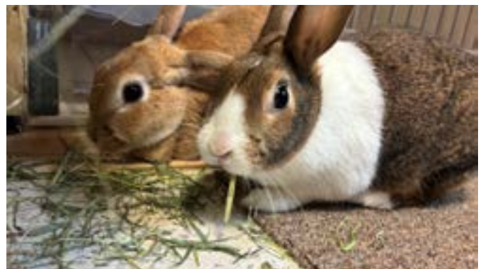
Bumble & Bee