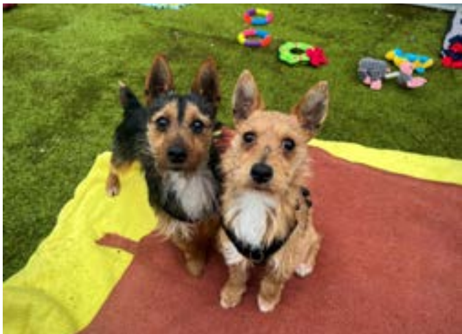
Pip & Squeak

Ruby continues to do well in foster care and recently featured in the Burgess (pet food) Greyhound and Lurcher Two-Week Takeover on social media. Stanley is being supported in his social media presence by terrier groups. There are lots of similar characters out there looking for homes. We're still hopeful and in the meantime, Stanley has been assisting with one of our nervous new arrivals, Lola, helping her settle in and feel safe so he is being a good team player!