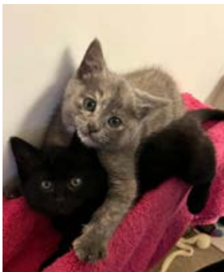
Peach & Pom pom

All things kittens are starting to ease off in the Cattery (famous last words), and we're pleased to report that all of the kittens and mums that we treated for the clostridium infection have found their forever homes. We haven't heard from everybody just yet, but from those who have sent in an update, everything has been going well and, even better, no more barrier nursing! I'm sure most of you saw us in our flattering white suits, but if you missed out, please see below!