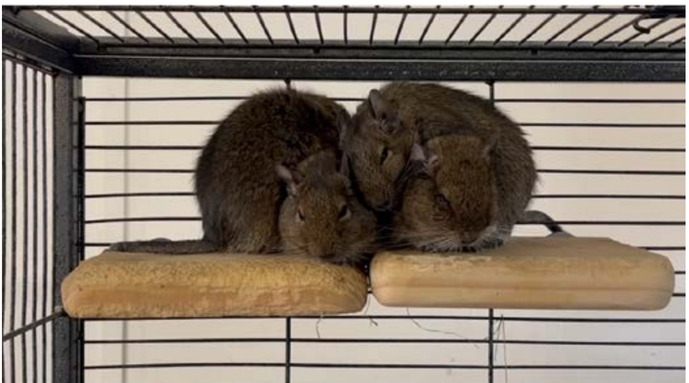
Snuggling Degus - finally rehomed!

There will be a more detailed communication sent out about the final stages of Project Terrapin creation as we progress towards an opening date.