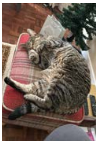
Tiny - home at last