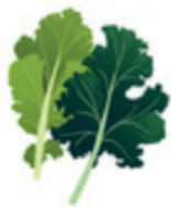
Dark green leafy greens & herbs