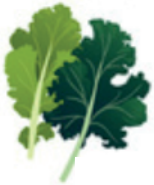
Dark green leafy greens and herbs