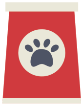
Healthy dog treats

Things you will need to make a party bag for your dog