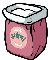
210g plain flour