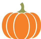
40g of pumpkin